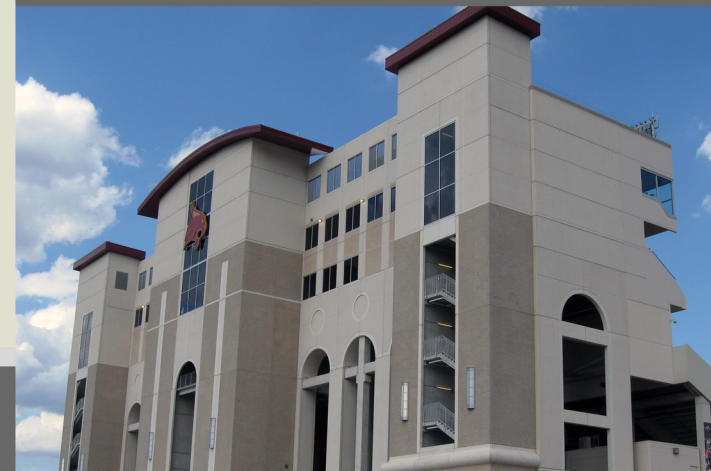
▼ TEXAS STATE UNIVERSITY BOBCAT STADIUM Architect: O'Connell Robertson