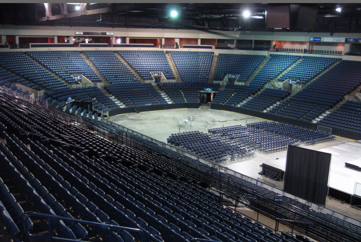
▼ LAREDO ENTERTAINMENT CENTER Architect: LAN, Inc.

NAPCO can provide all the major components to build entire Sports and Entertainment Complexes. On Texas State University's Bobcat Stadium (below), NAPCO not only produced the risers, raker beams, slabs, stairs, and interior walls; we also supplied the columns, box beams, brick veneer panels, and architectural sand-blasted panels.