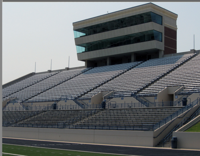
▼ TOM KIMBROUGH STADIUM Architect: PBK Architects, Inc.

Site-cast concrete is more susceptible to weather conditions and delays than precast concrete which is poured and inspected prior to being shipped for erection. As on Tom Killbaugh Stadium (center page) an entire section of risers can be erected in a single day.